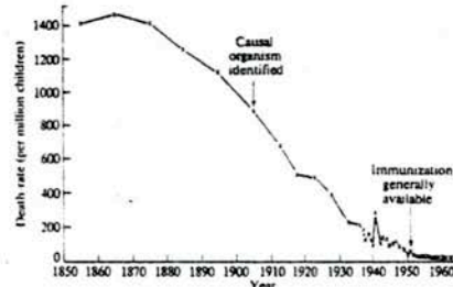
FIGURE 8.12. Whooping cough: death rates of children under 15; England and Wales.